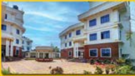
NEF COLLEGE OF HEALTH SCIENCES, GUWAHATI