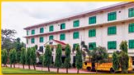
NEF COLLEGE OF PHARMACEUTICAL EDUCATION & RESEARCH, NAGAON