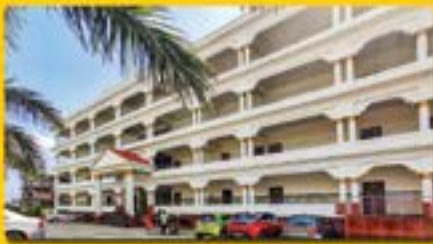
NEF COLLEGE OF PHARMACY, GUWAHATI