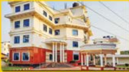
NEF INSTITUTE OF NURSING, GUWAHATI