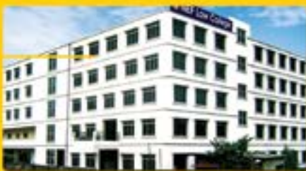
NEF LAW COLLEGE, GUWAHATI