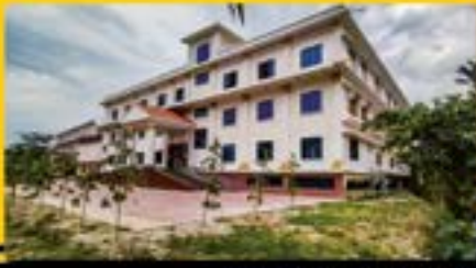
IQRA ACADEMY OF NURSING, NAGAON