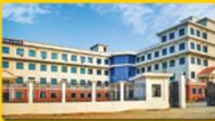
NEF COLLEGE, GUWAHATI