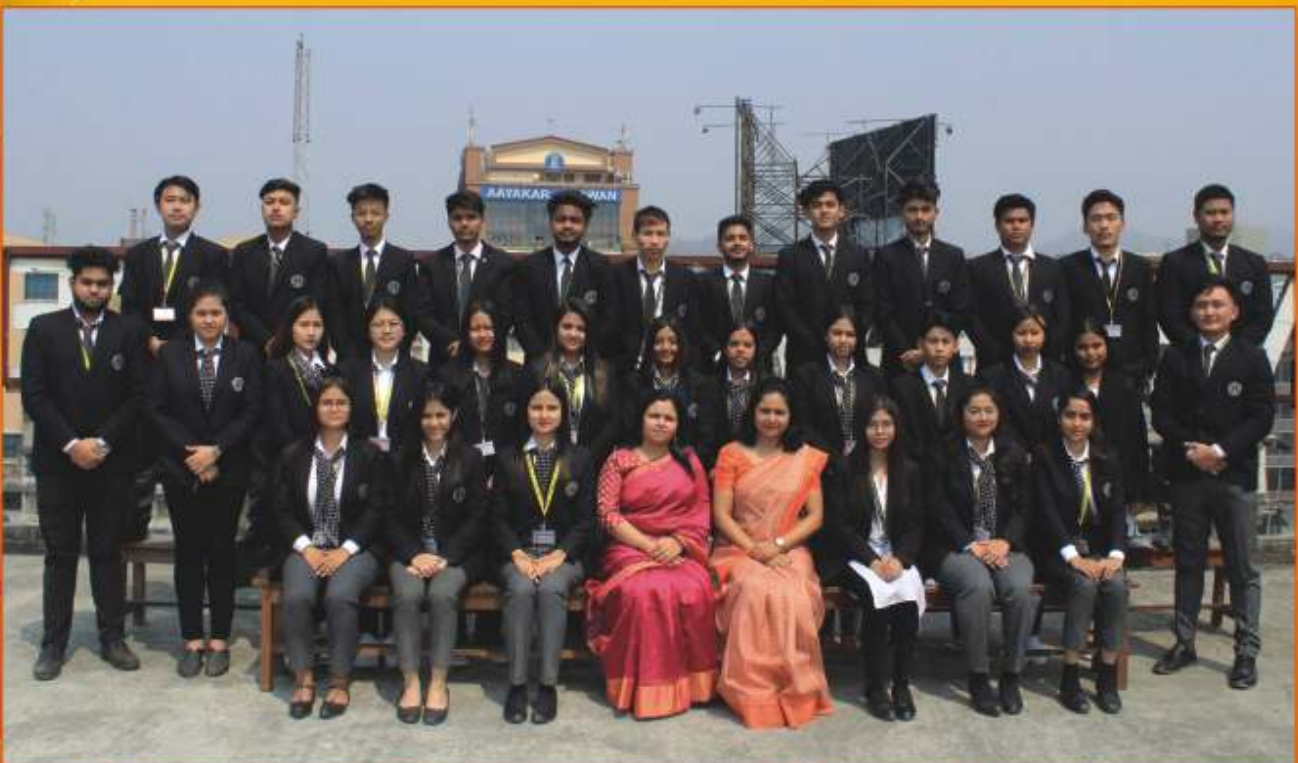
B.B.A. LL.B (H), 1st Semester (Sec-A+B)