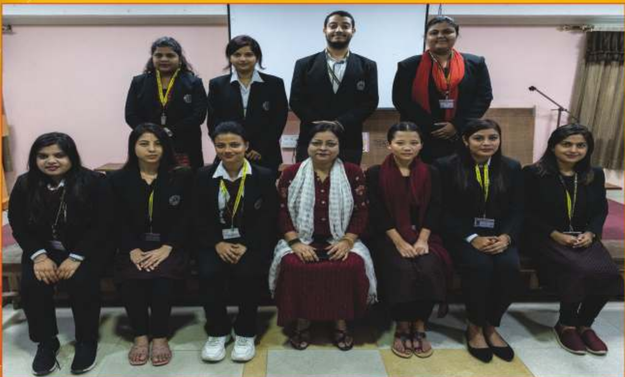
LL.M 3rd Semester Constitutional Law Group