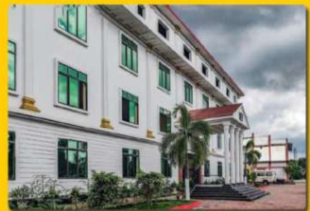
NEF College of Pharmaceutical Education & Research, Nagaon