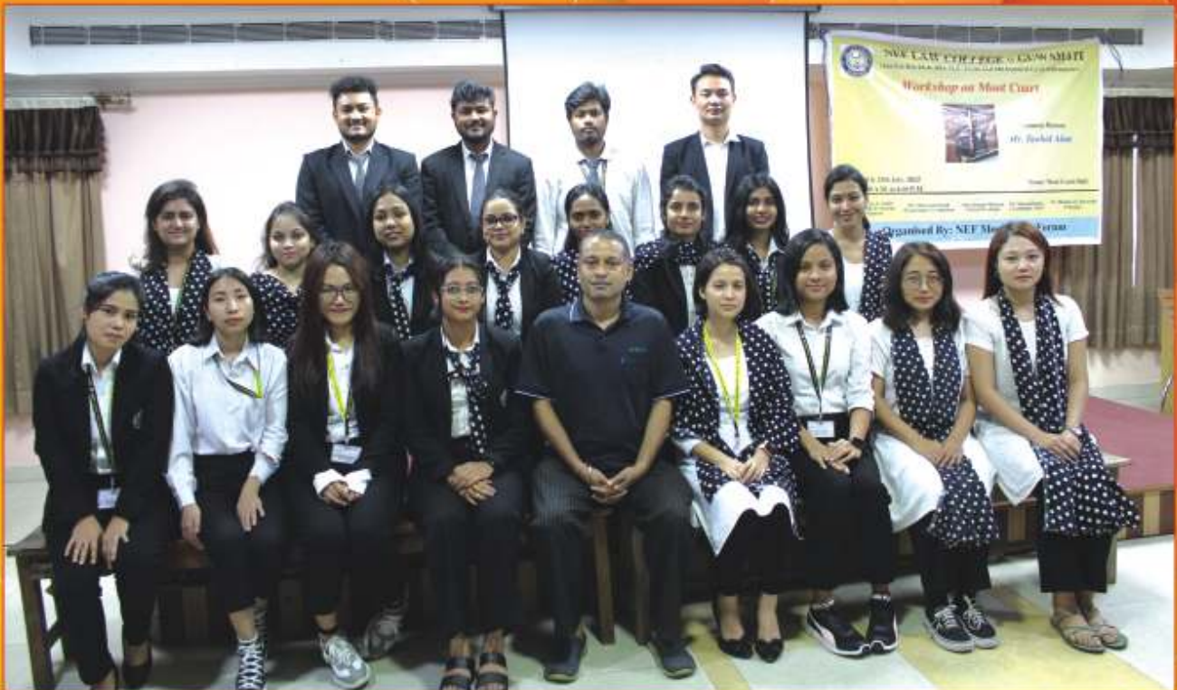
LL.B/LL.B (H), 6th Semester (Sec-B)