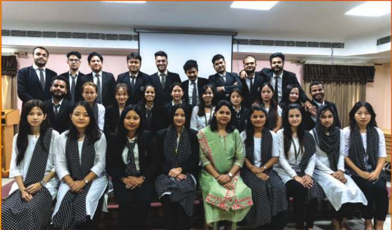
B.A. LL.B (H), 8th Semester (Sec-A)