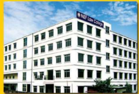
NEF Law College, Guwahati