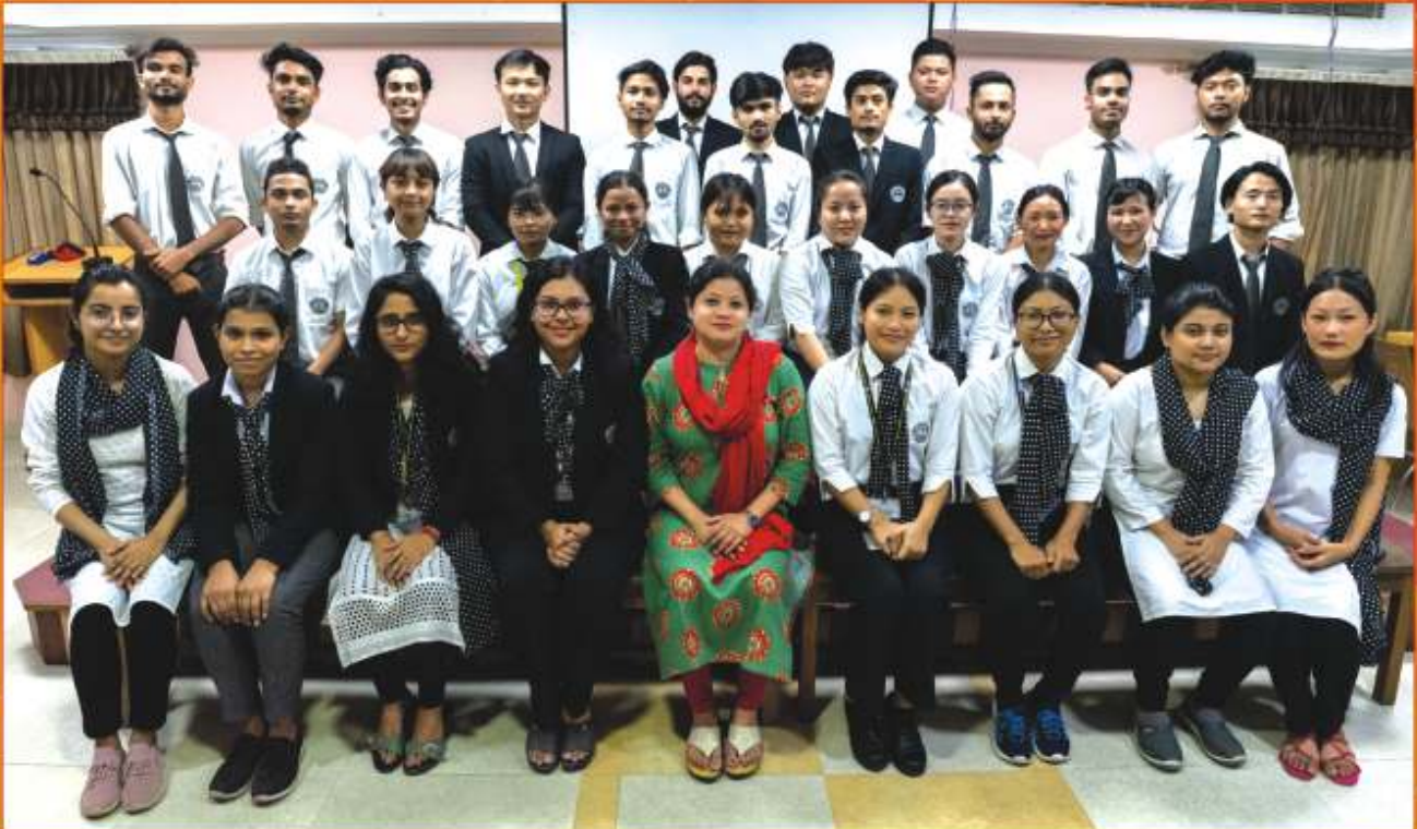
B.B.A. LL.B (H) 6th Semester