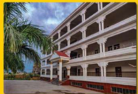
NEF College of Pharmacy, Guwahati