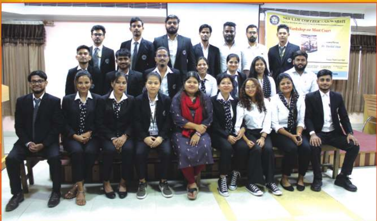
LL.B/LL.B (H), 6th Semester (Sec-C)