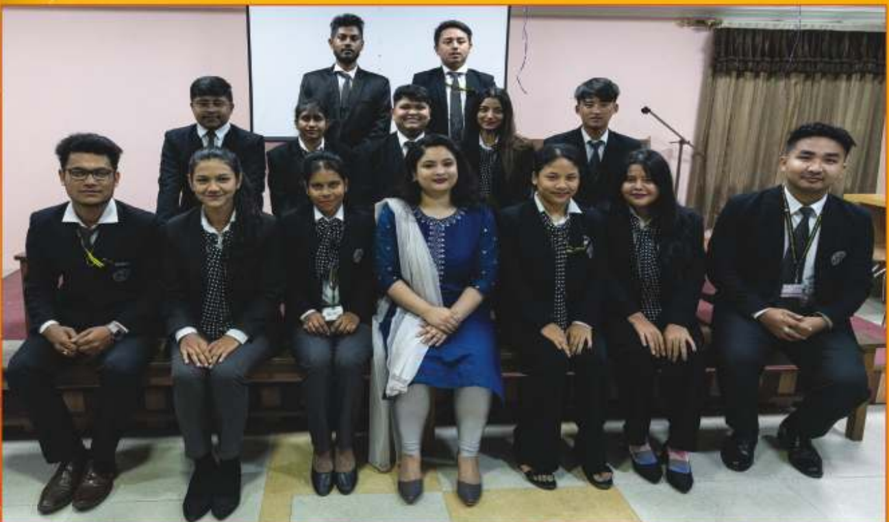
B.B.A. LL.B (H), 4th Semester (Sec-B)