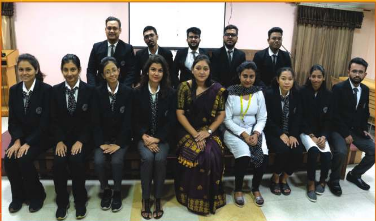
B.Com LL.B (H), 8th Semester