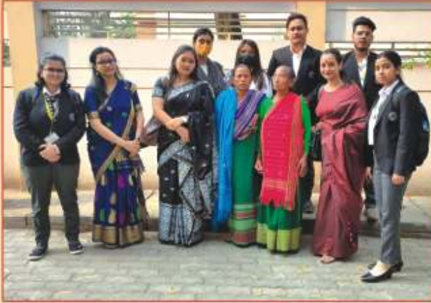
A group photo with Padmashree Birubala Rabha