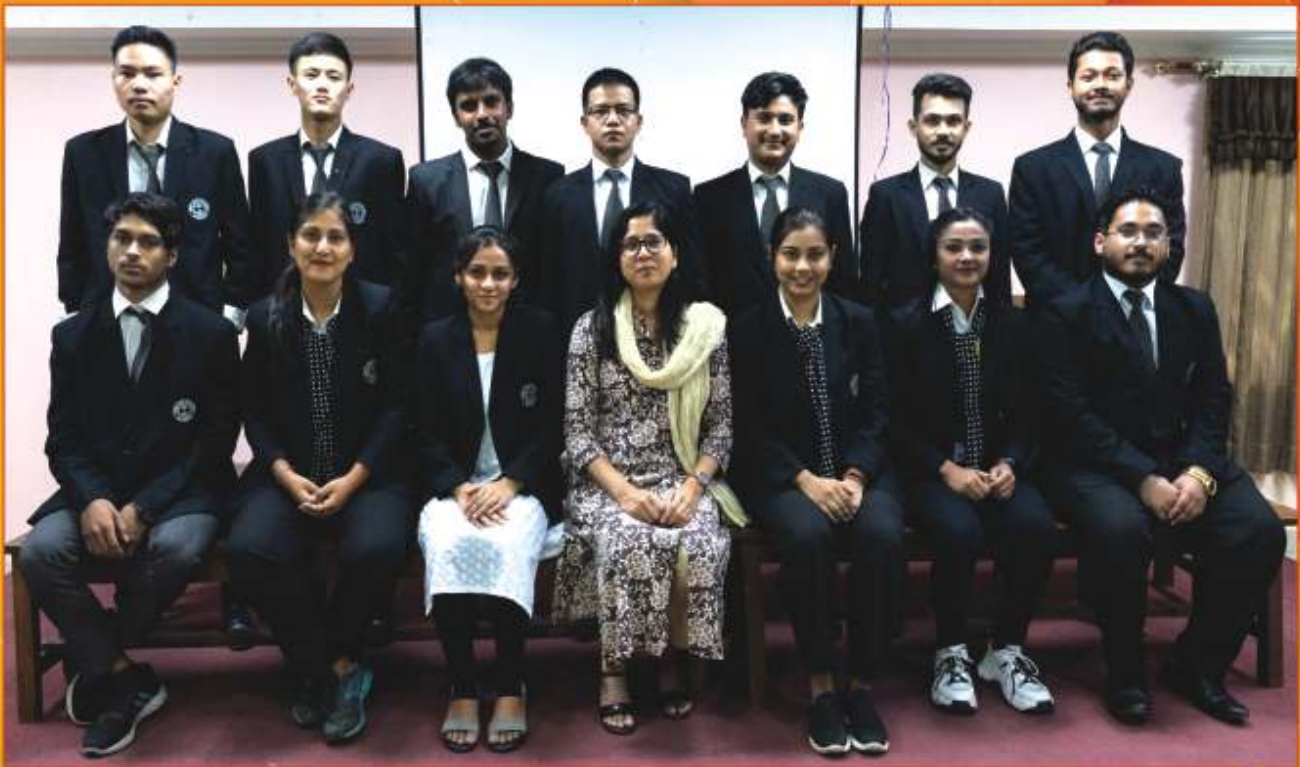
B.A. LL.B (H), 6th Semester (Sec-A)