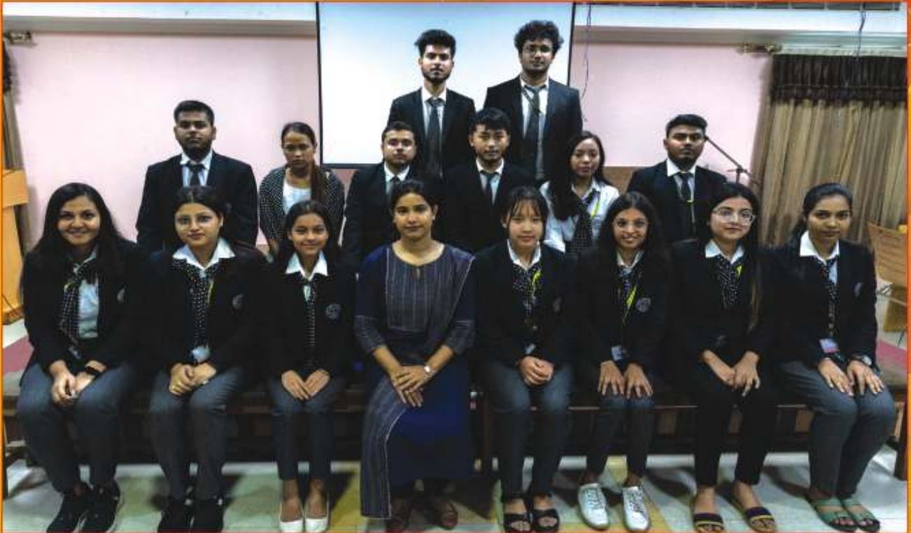
B.Com LL.B (H), 4th Semester