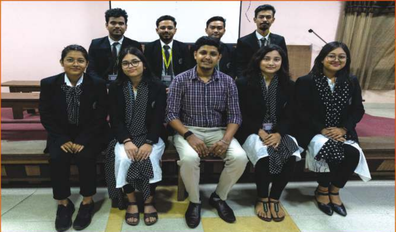
B.B.A. LL.B (H), 4th Semester (Sec-A)