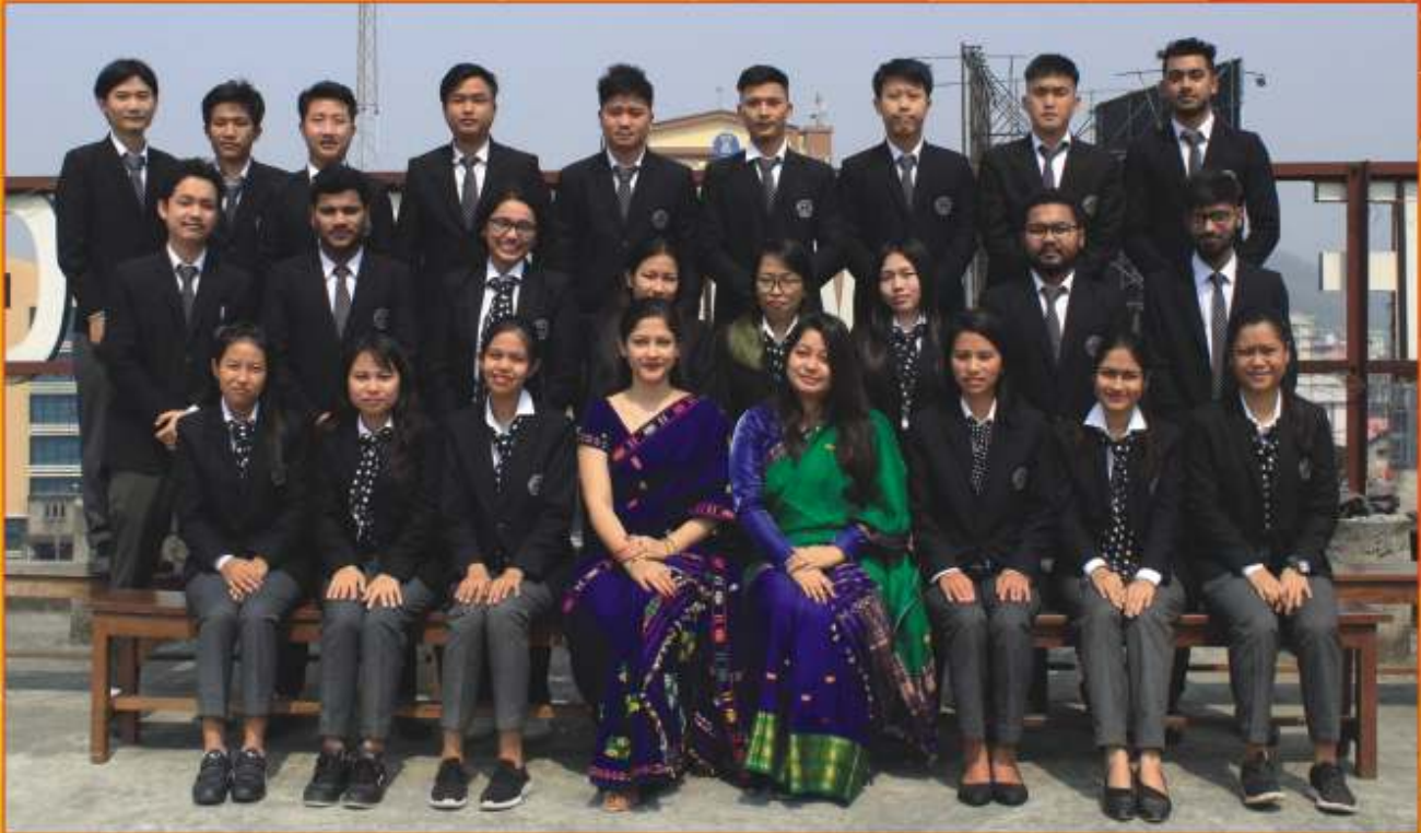
LL.B./LL.B (H), 1st Semester (Sec-B+C)