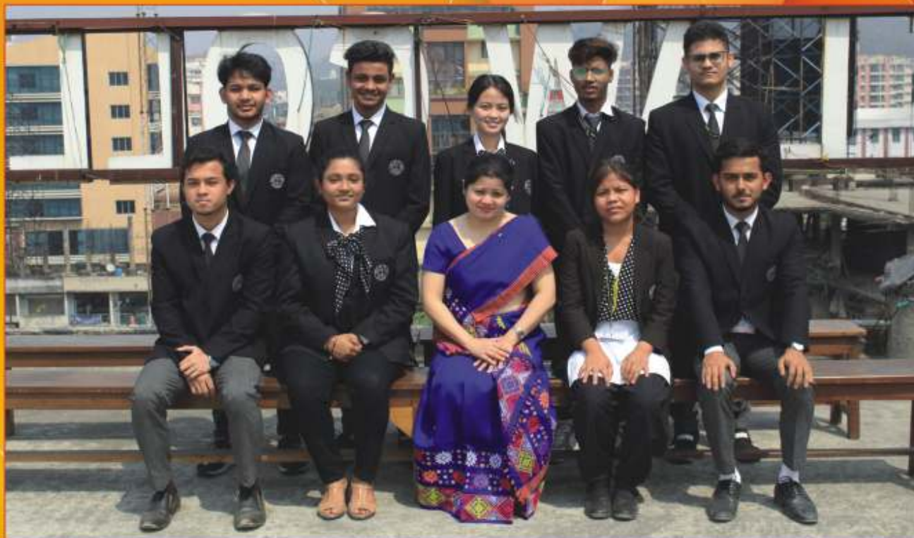
B.Com. LL.B (H), 1st Semester