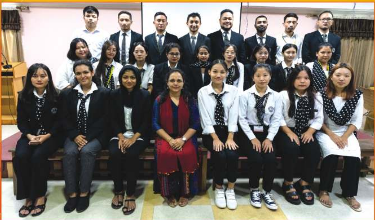
LL.B./LL.B (H), 4th Semester (Sec-A)