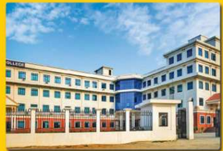
NEF College, Guwahati

f/NEFLawCollege | f/nefcollege | f/nefcollegeofpharmacy