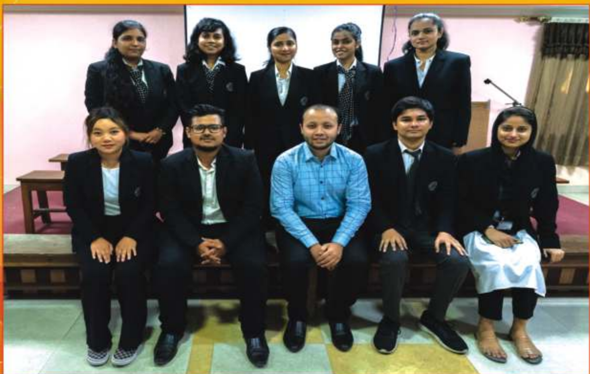
B.Com LL.B 10th Semester