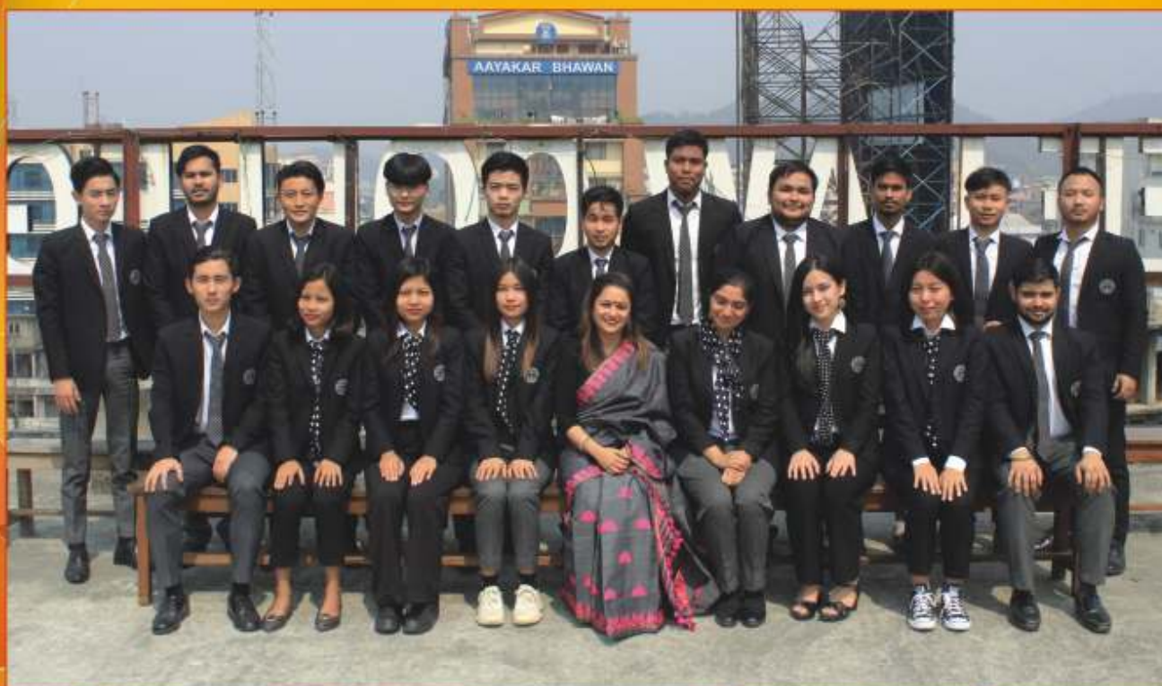
LL.B./LL.B (H), 1st Semester (Sec-A)