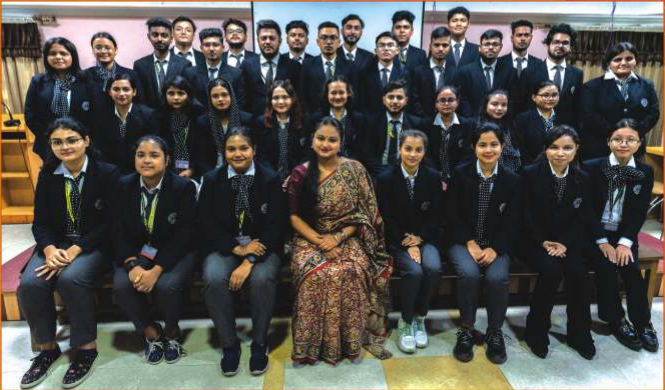
B.A. LL.B (H), 4th Semester (Sec-A)