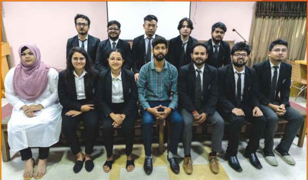
B.B.A. LL.B (H), 10th Semester