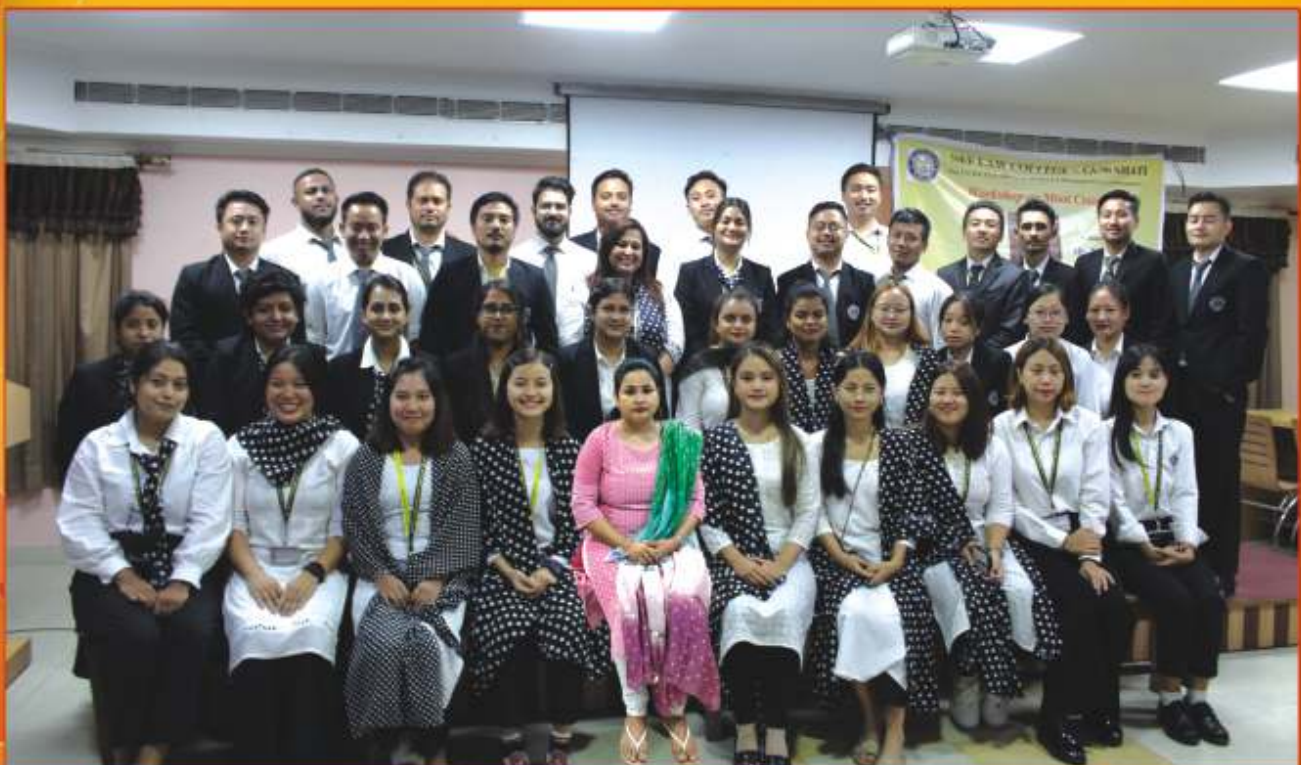
LL.B/LL.B (H), 6th Semester (Sec-A)