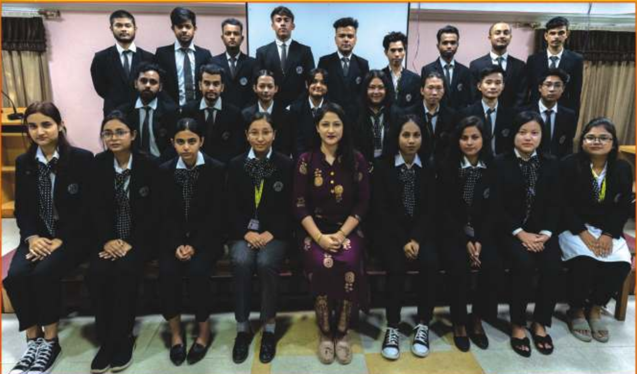
B.A. LL.B 4th Semester (Sec-B)