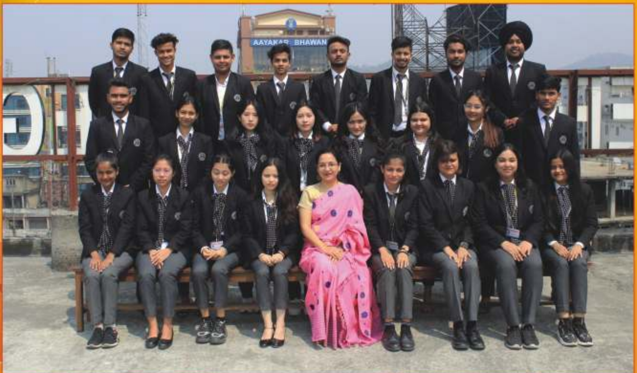
B.A. LL.B (H), 1st Semester (Sec-B)