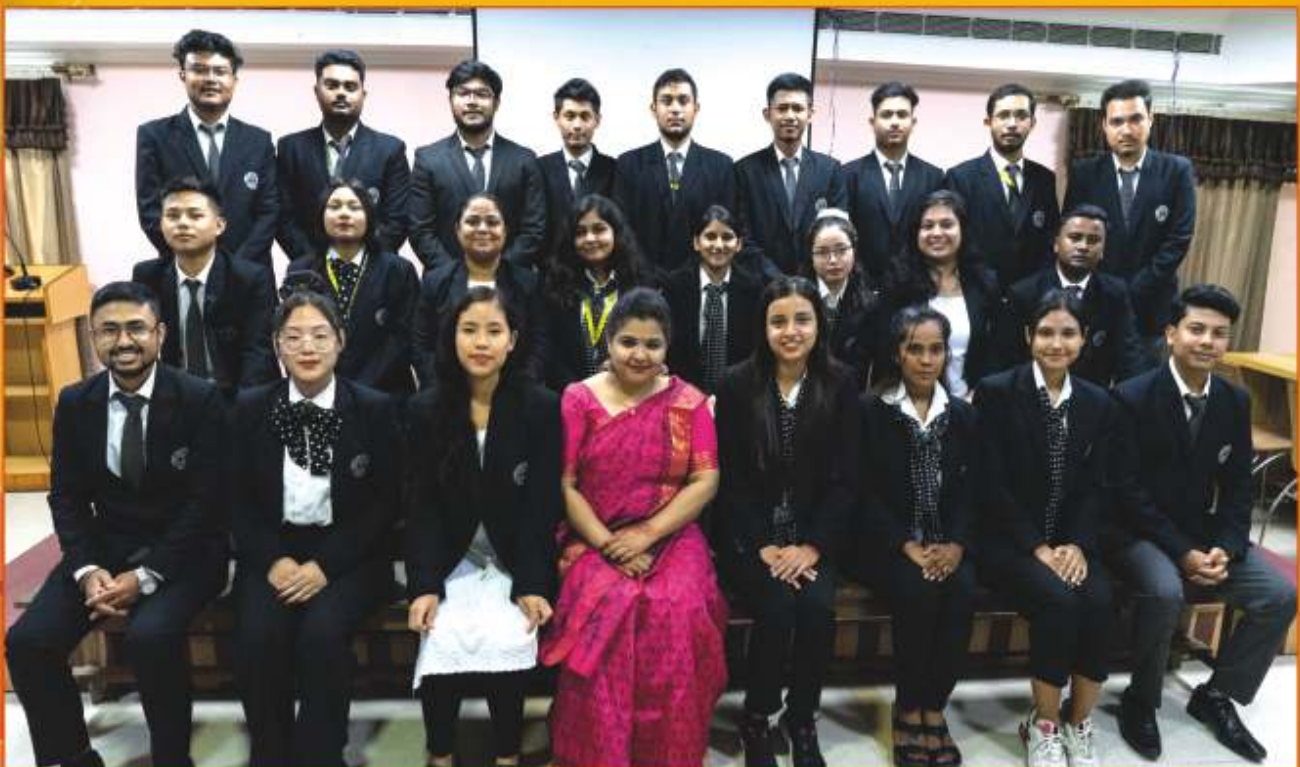
B.A., LL.B (H), 6th Semester (Sec-B)