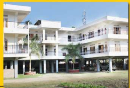
Iqra Academy of Nursing, Nagaon