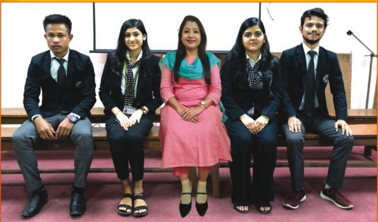
B.Com LL.B 6th Semester