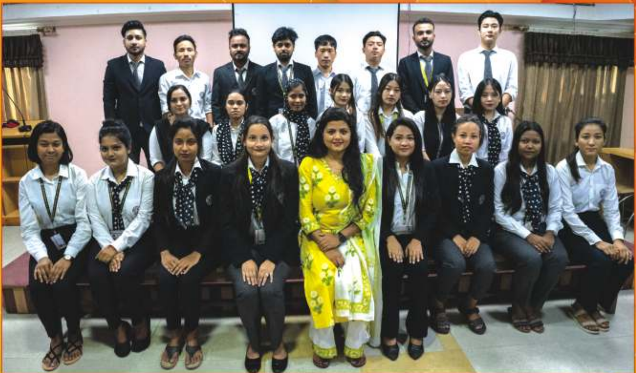
LL.B/LL.B (H), 4th Semester (Sec-B+C)