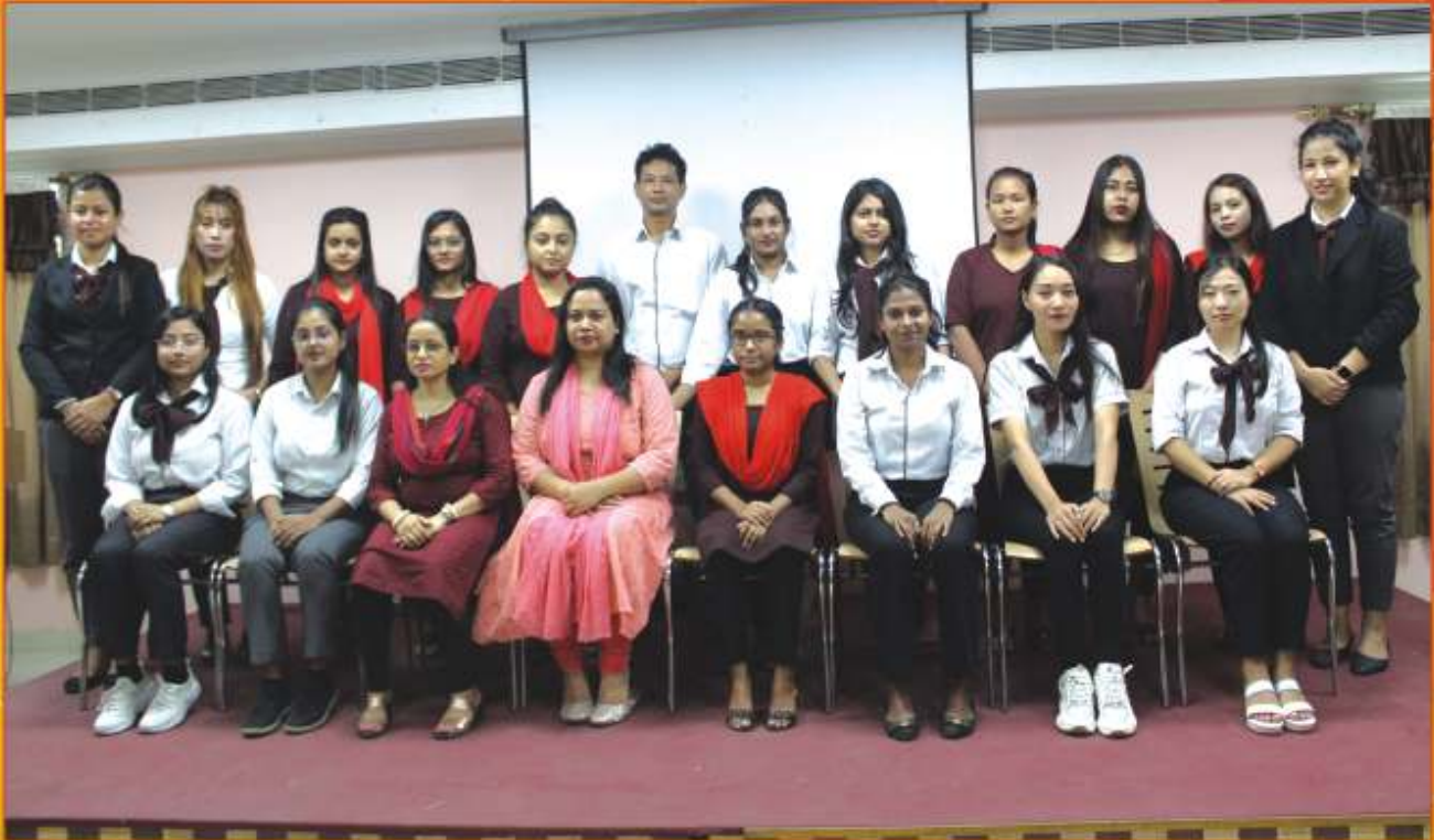
LL.M 1st Semester