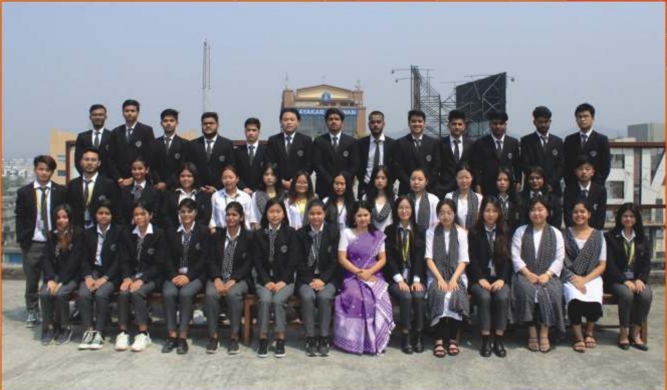
B.A. LL.B (H), 1st Semester (Sec-A)