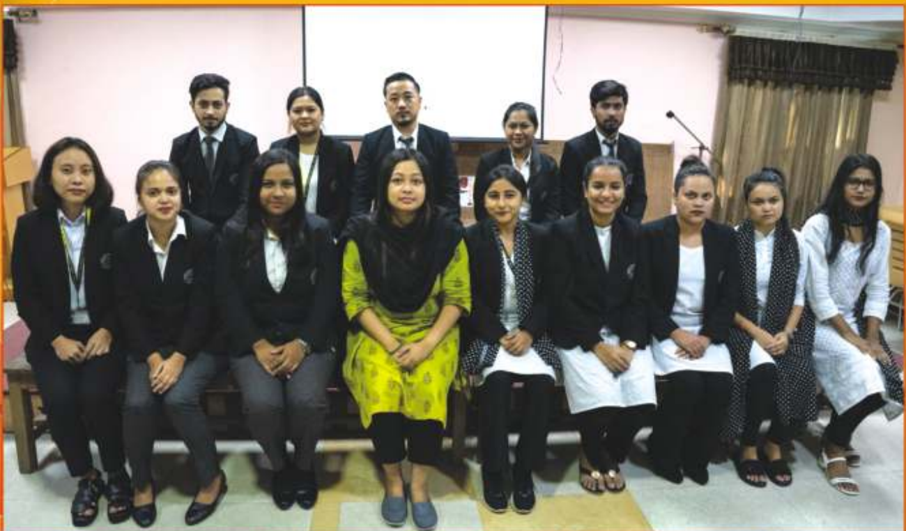
B.A. LL.B (H), 10th Semester (Sec-B)