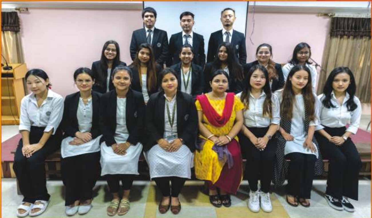
B.A. LL.B (H), 10th Semester (Sec-A)